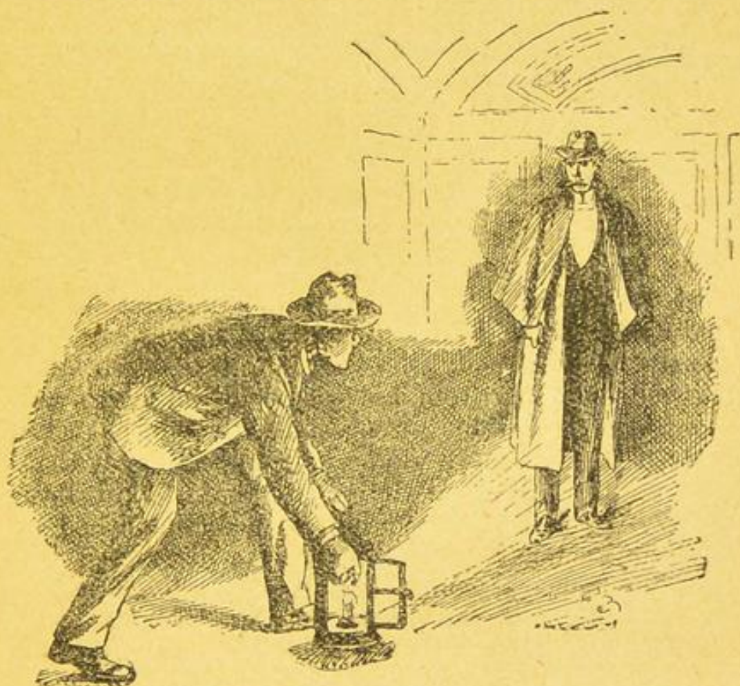
"HE STOOPED TO THE LANTERN."

"You devil, what do you mean?" roared Kennedy. He was running about in little circles and clasping at the solid blackness with both hands.